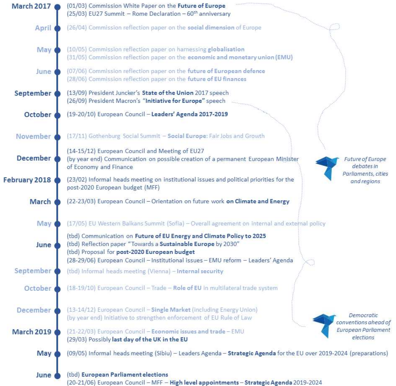
Figure 1: Timeline for discussions on future of Europe