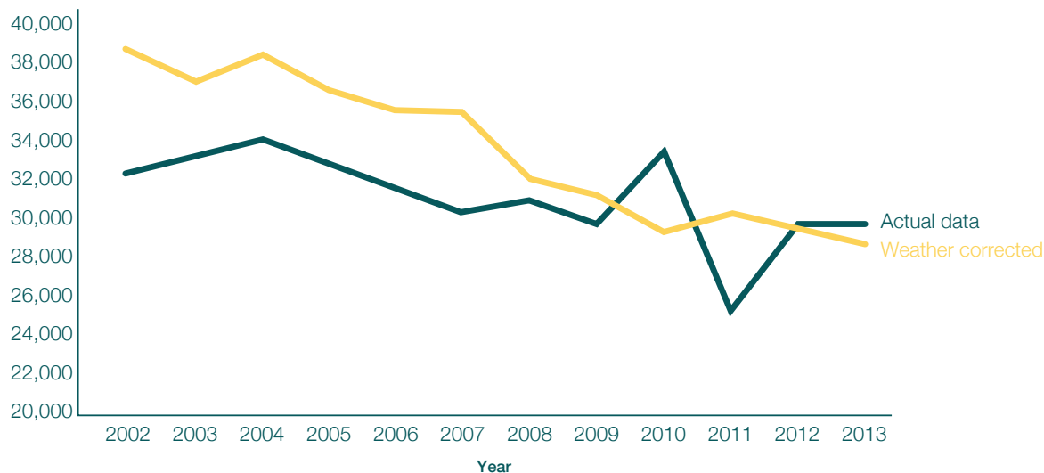
Figure 2: Gas consumption by UK households (2002-2013)

Source: DECC (2014b): Energy consumption in the UK. London, DECC and DECC 2014, Energy trends section 7: weather. Online: https://www.gov.uk/government/statistics/energy-trends-section-7-weather